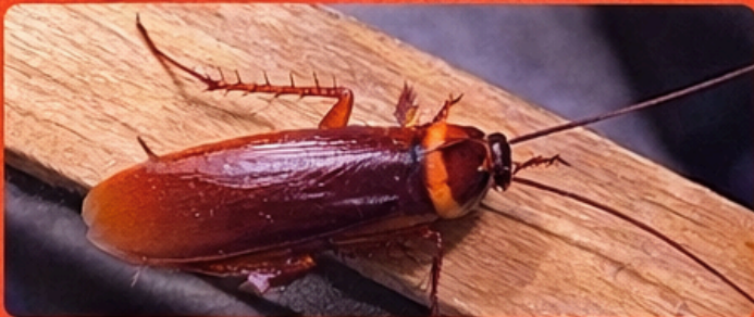
American Cockroach ( Periplaneta americana )