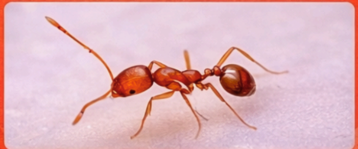
Ants ( Monomorium pharaonis, Solenopsis spp. )